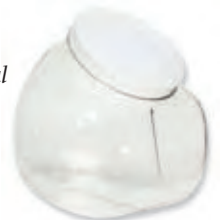
D105 Display Jar Unbreakable, clear plastic countertop display jar. Ideal for small items (see p. 33, pens, and p. 51, Horse Shave)