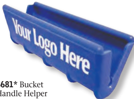
S681* Bucket Handle Helper