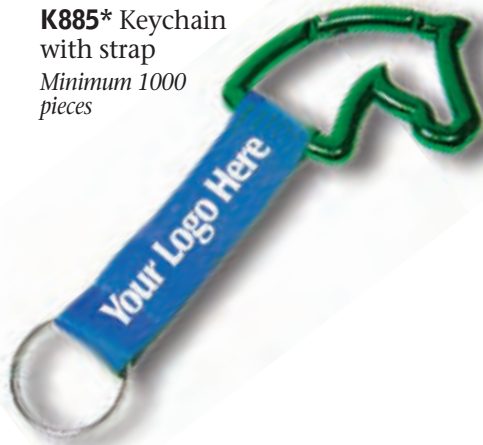
K885* Keychain with strap Minimum 1000 pieces