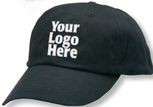
Z1091 Ball Cap Various colors and styles available